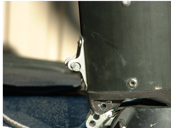
The custom mast track attachment fitting (PN 11870000 HCUS & HCAUS / PN 18061611 HCE) is the only class legal fitting for this purpose. It works with both H14 and H16. The position of the fitting in the mast track is optional to the owner's and skipper's specification.

Hint: It is highly recommendable to use a gooseneck bearing with the upgraded downhaul system as it eliminates drag and improves adjustability. The gooseneck bearing part is available from the Hobie dealers.