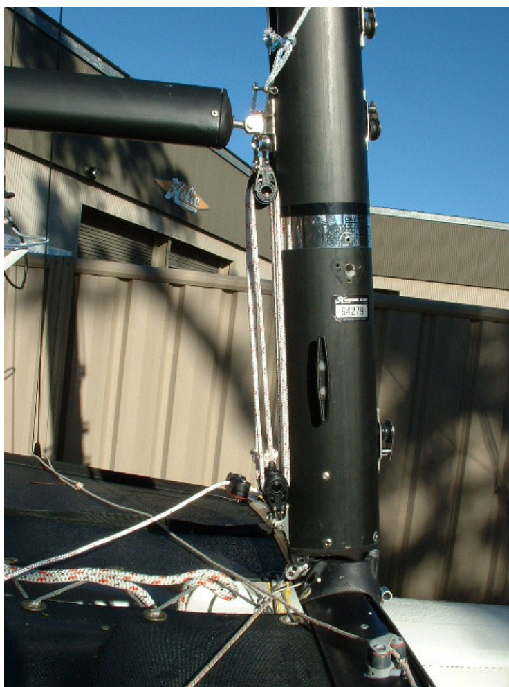
The upgraded downhaul system.