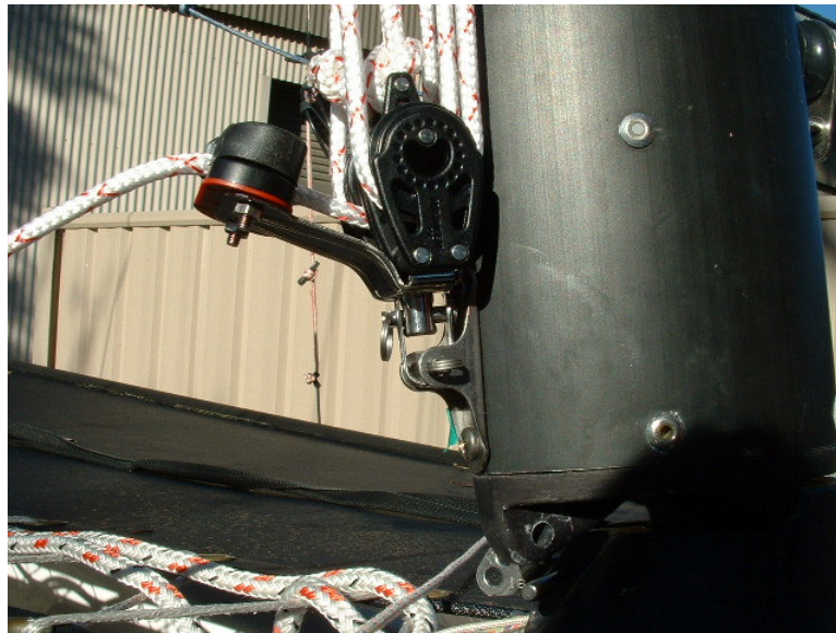
The lower block w. cam and the custom mast track attachment fitting.